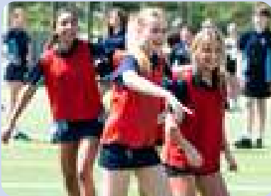
Silly Sports Day 2026