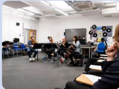
Year 11 Music students learning from the Carducci String Quartet