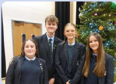
Year 10 Windrush winning the first House University Challenge!