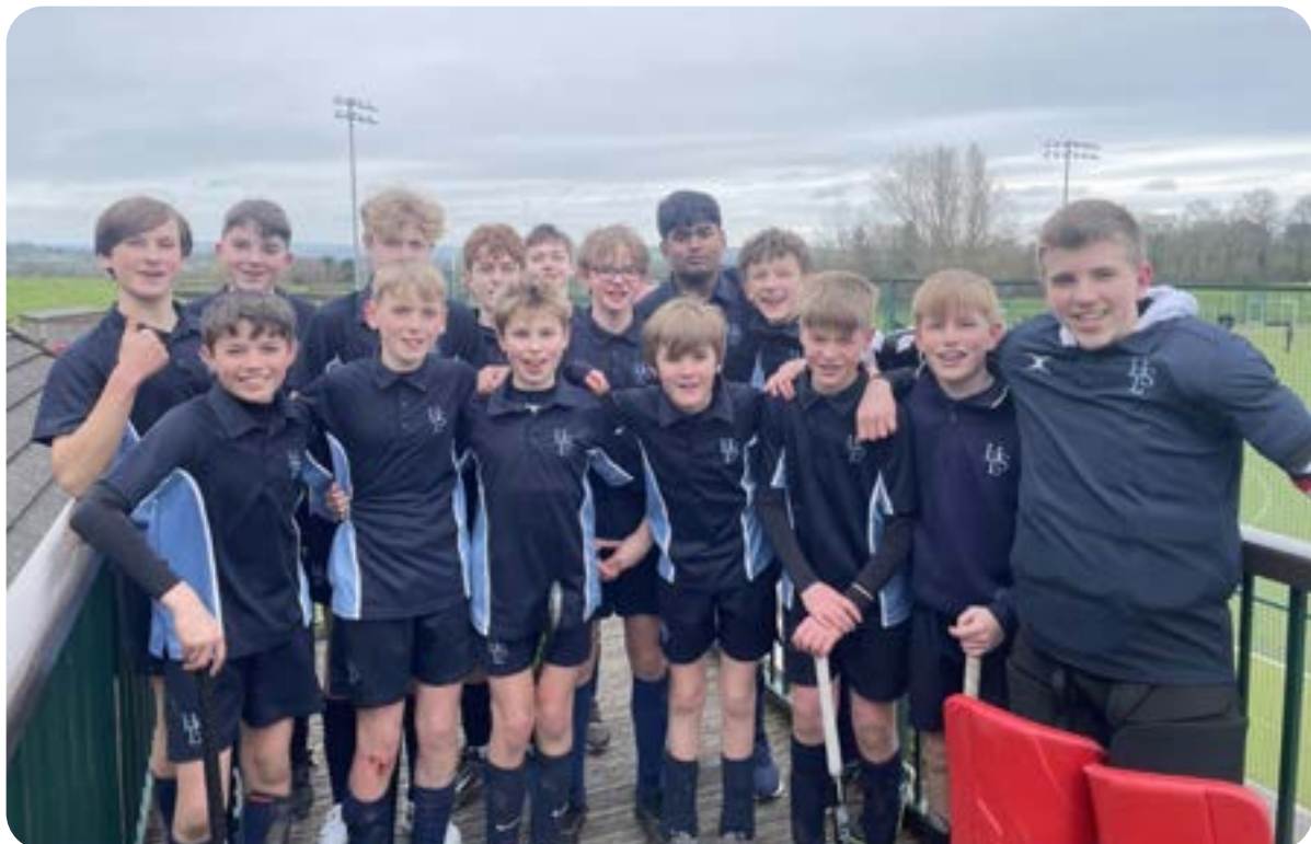
Year 9 Hockey Team

The illustrious House Badminton competition served up a fantastic display of high-level competition between the year groups. Both boys and girls competitions ran on consecutive weeks, with a total of 256 players taking to the court, not including the substitutes! Scores will be tallied and the results will be published on the PE noticeboard shortly!