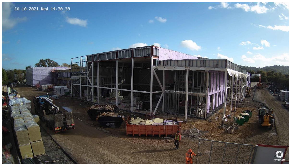
The view of the school Hall and West Wing