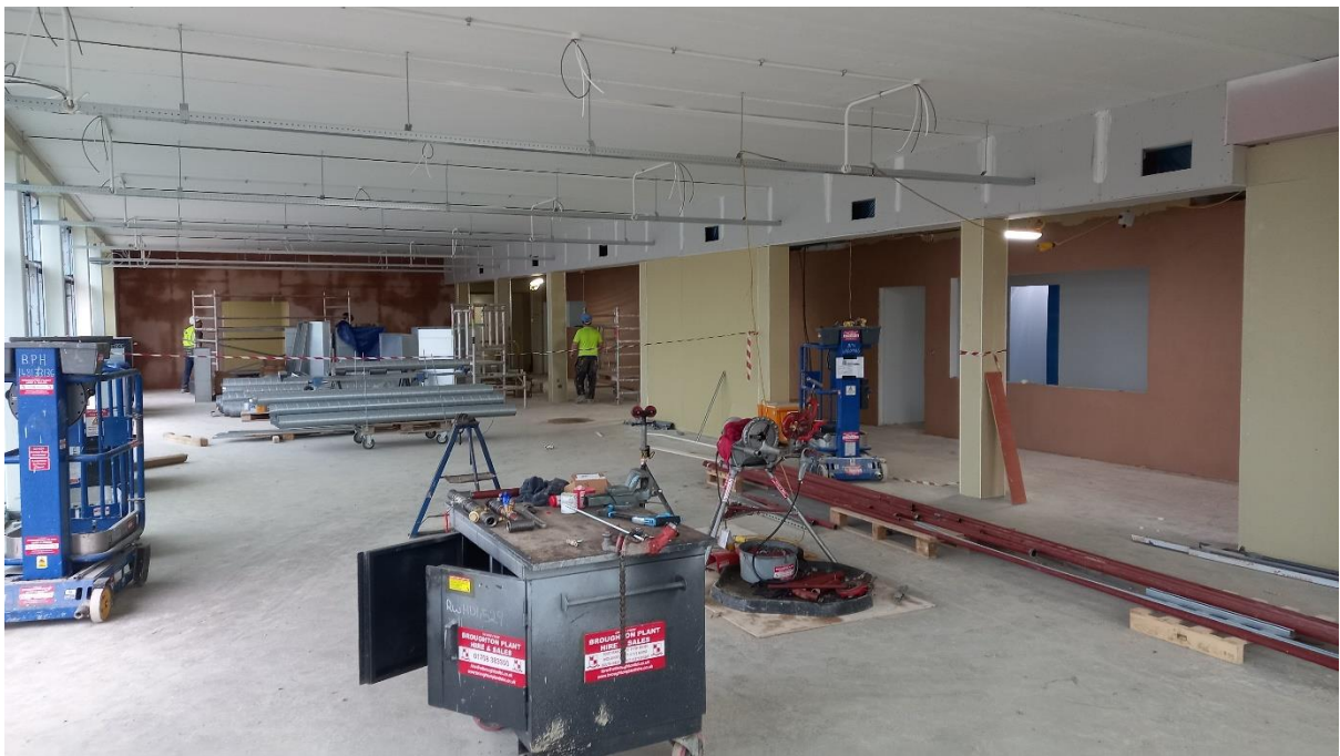
The Dining Hall