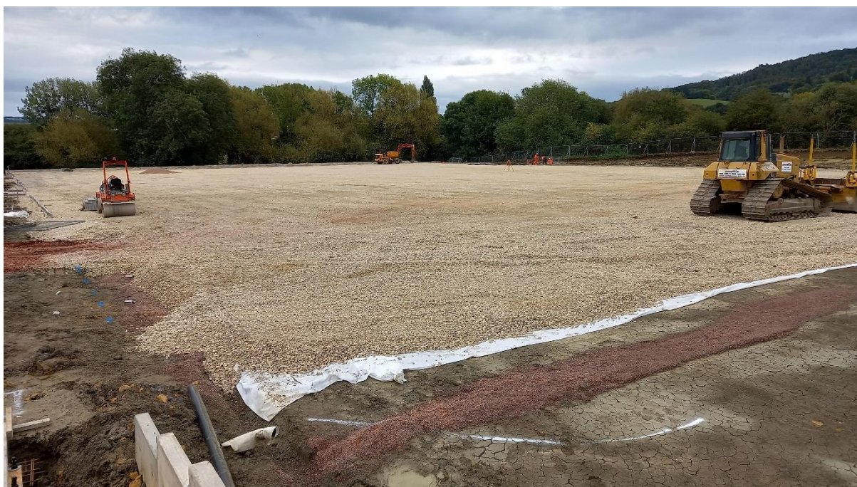
The Astro Pitch