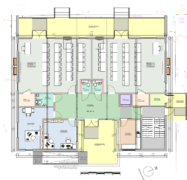
GROUND FLOOR PLANS